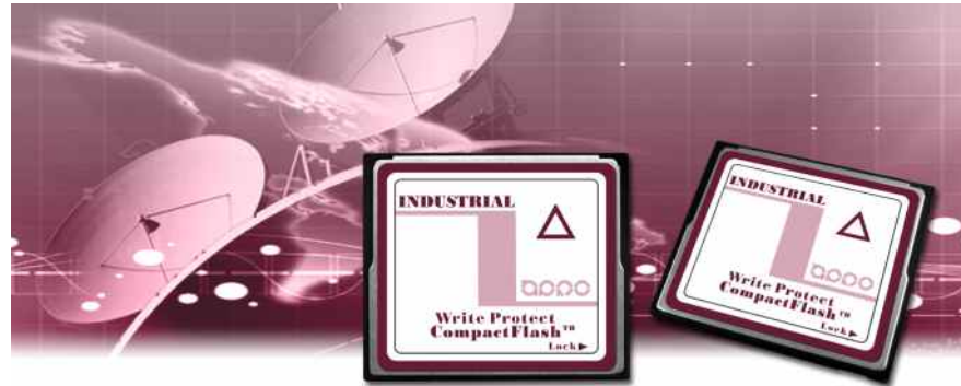
Write-protect switch on CF frame kit